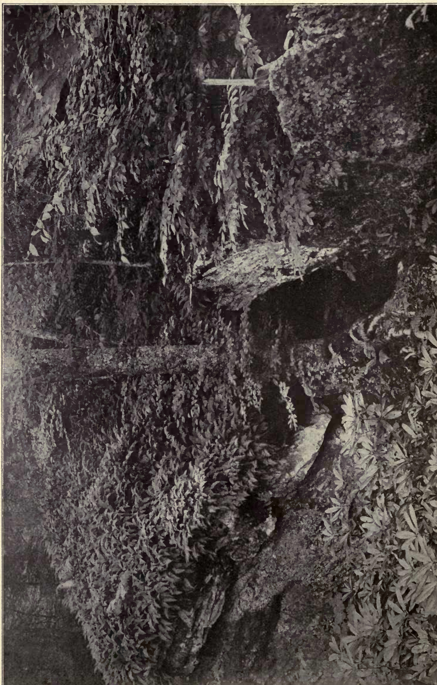
I. Vegetation on Yew Mountains, Greenbrier County